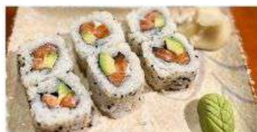
Salmon Avocado Roll $15.00