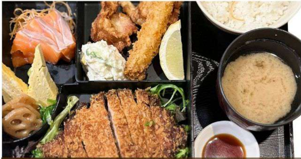
Katsu Lunch Box (pork or chicken) $23.00

with Appetizer, Sashimi, Prawn Katsu, Karaage, Steamed Rice and Miso Soup