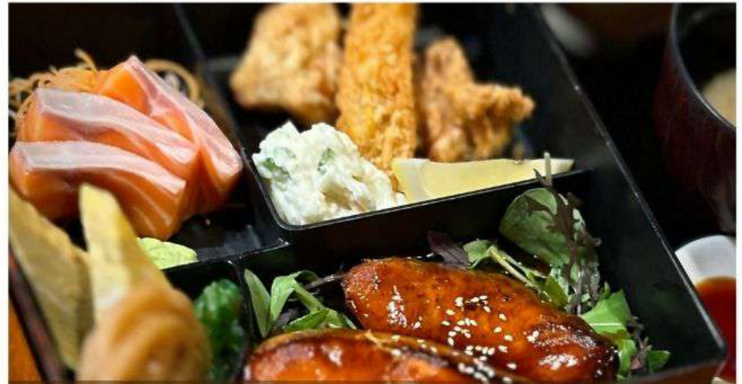
Teriyaki Salmon Lunch Box $23.00

with Appetizer, Sashimi, Prawn Katsu, Karaage, Steamed Rice and Miso Soup