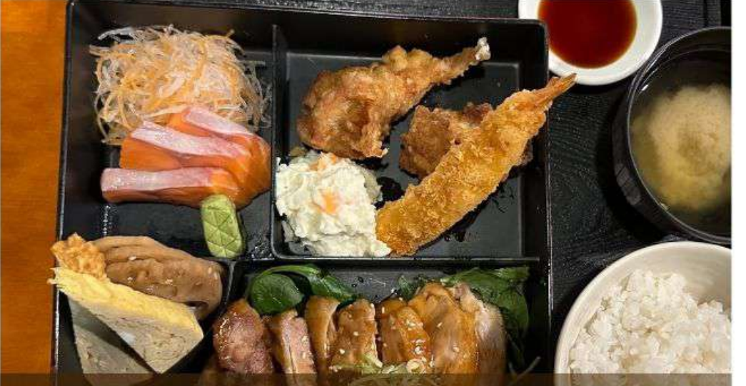
Teriyaki Chicken Lunch Box $23.00

with Appetizer, Sashimi, Prawn Katsu, Karaage, Steamed Rice and Miso Soup