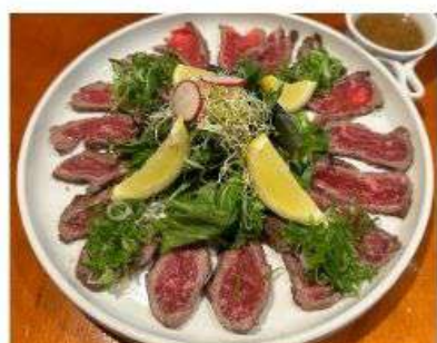
Beef Tataki S $18.00 / L $32.00