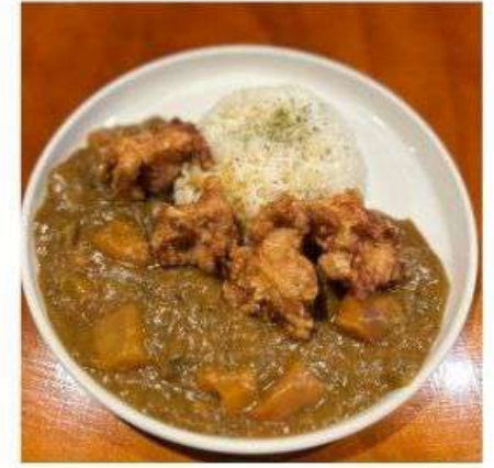
Karaage Curry $22.00 Japanese Fried Chicken