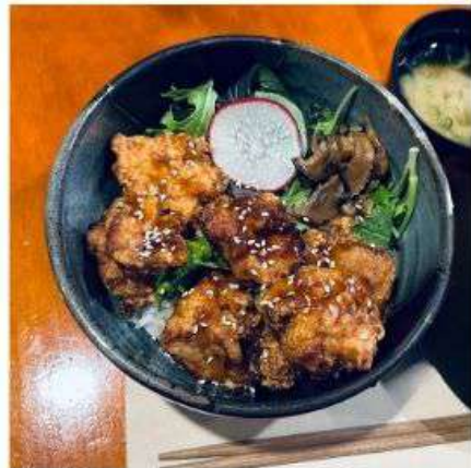
Karaage Don $21.00 Japanese Fried Chicken