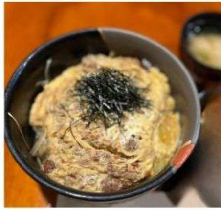
Katsu Don $22.00 Pork or Chicken w. Egg