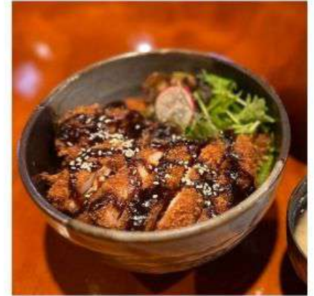
Miso Katsu Don $21.00 Pork or Chicken