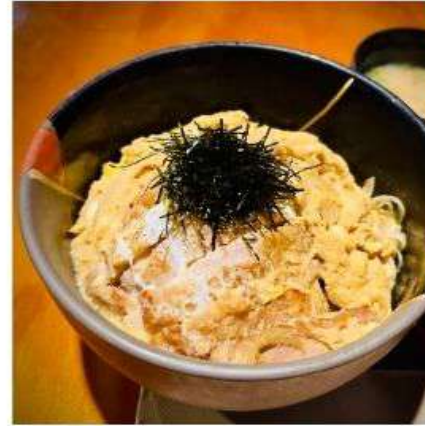
Oyako Don $21.00 Chicken and Egg