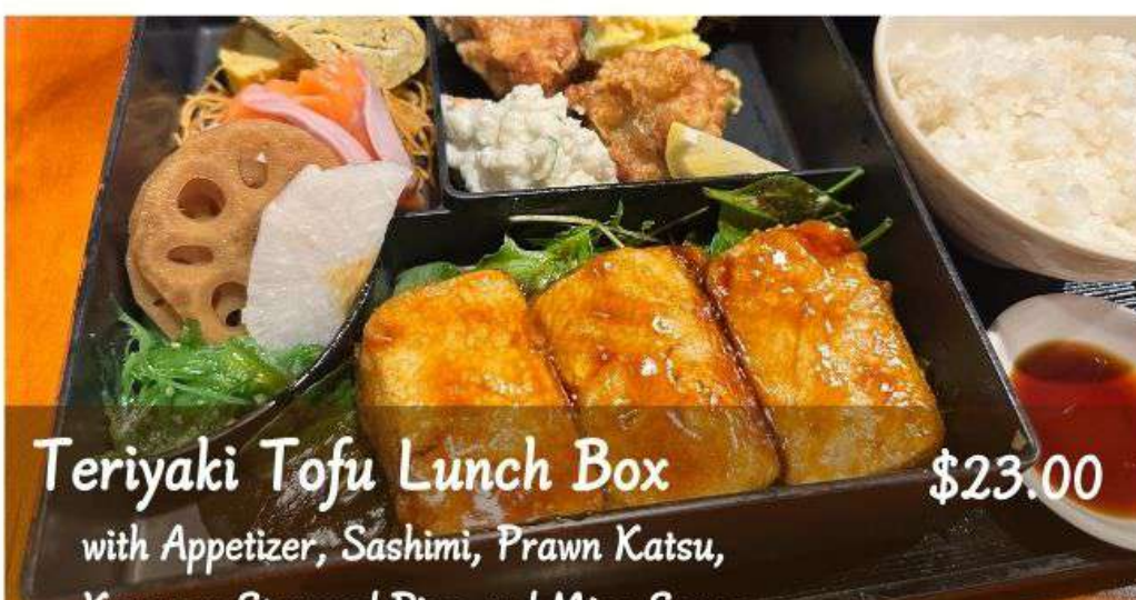
Teriyaki Tofu Lunch Box $23.00

with Appetizer, Sashimi, Prawn Katsu, Karaage, Steamed Rice and Miso Soup