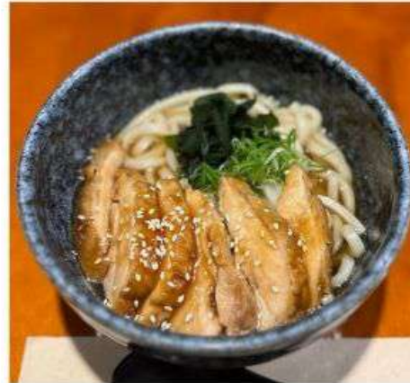
Teriyaki Chicken $24.00 Udon