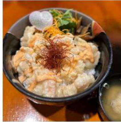
Ebi Mayo Don $24.00