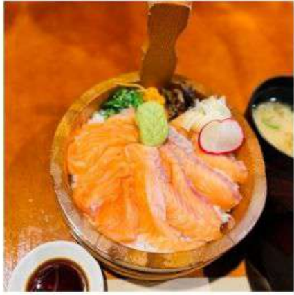
Fresh Salmon Don $26.00