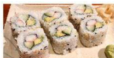
California Roll. $13.00