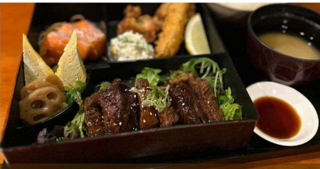
Teriyaki Beef Lunch Box $23.00

with Appetizer, Sashimi, Prawn Katsu, Karaage, Steamed Rice and Miso Soup