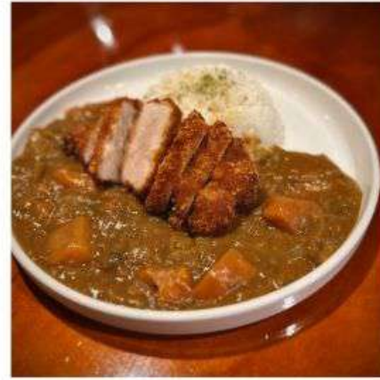
Katsu Curry $22.00 Pork or Chicken w. Egg