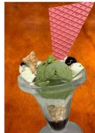
Matcha Parfait $14.00