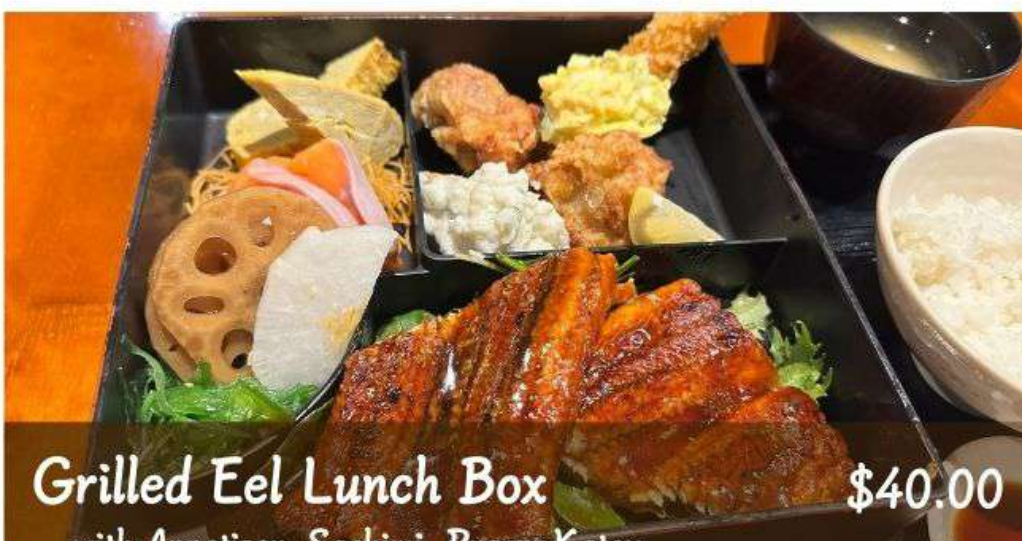
Grilled Eel Lunch Box $40.00

with Appetizer, Sashimi, Prawn Katsu, Karaage, Steamed Rice and Miso Soup