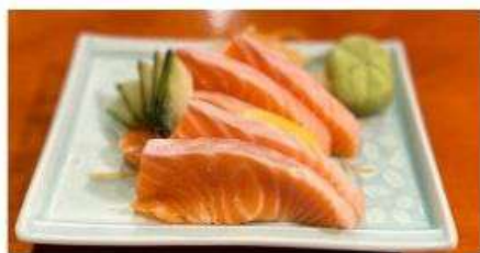
Salmon Sashimi 5pcs.$18.00/ 10pcs $32.00