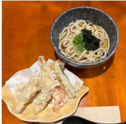
Tempura Udon $24.00