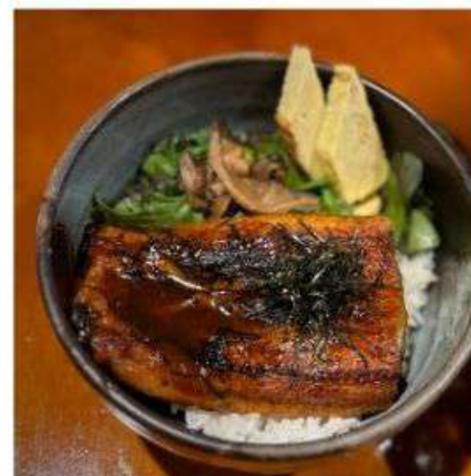
Grilled Eel Don $30.00